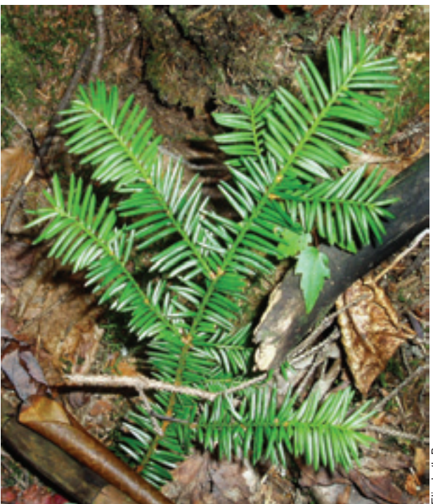
Most people don't think of conifers having leaves, but that's exactly what the narrow, waxy needles are.

than on broad-leaved trees. Their leaf surfaces are thick and waxy and their needles don't fall at once. Thus, conifers keep their leaves, continuing photosynthesis, yet they reduce water loss and tend to drop snow